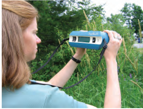
A lot has changed since 2006, when The Song Sleuth was reviewed in the March/April installment of Birding's "Tools of the Trade."

The Song Sleuth was one of the first attempts to digitally identify birdsong. Its creators, Wildlife Acoustics, claimed an 80% success rate, providing the three most-likely choices from among its stored database of 60 species. Lovitch tested the device and found it did help narrow the choices, but demanded a noise-free single-bird recording from within 50 feet. It was not ready