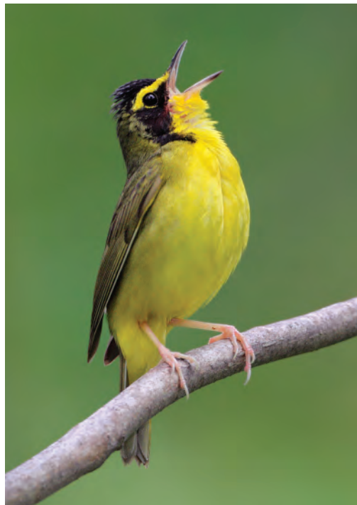
This Kentucky Warbler is giving us a good view. But the species is notorious for staying out of sight while singing. When a bird can’t be seen, a computer-confirmed sound match would be a big help. Might the day come when “heard-only” birds are routinely identified not by our ears and brains, but rather by apps? This review takes a look at the somewhat bumpy but nevertheless promising development of software for automatically identifying birds by their vocalizations.

Because the Dickcissel’s call is relatively distinct from other avian night flight calls, Dick is at least 85% accurate, only occasionally fooled by buntings, Blue Grosbeak, or a particular pre-dawn Purple Martin call. The Dick software is still in use today, has made important conserva-