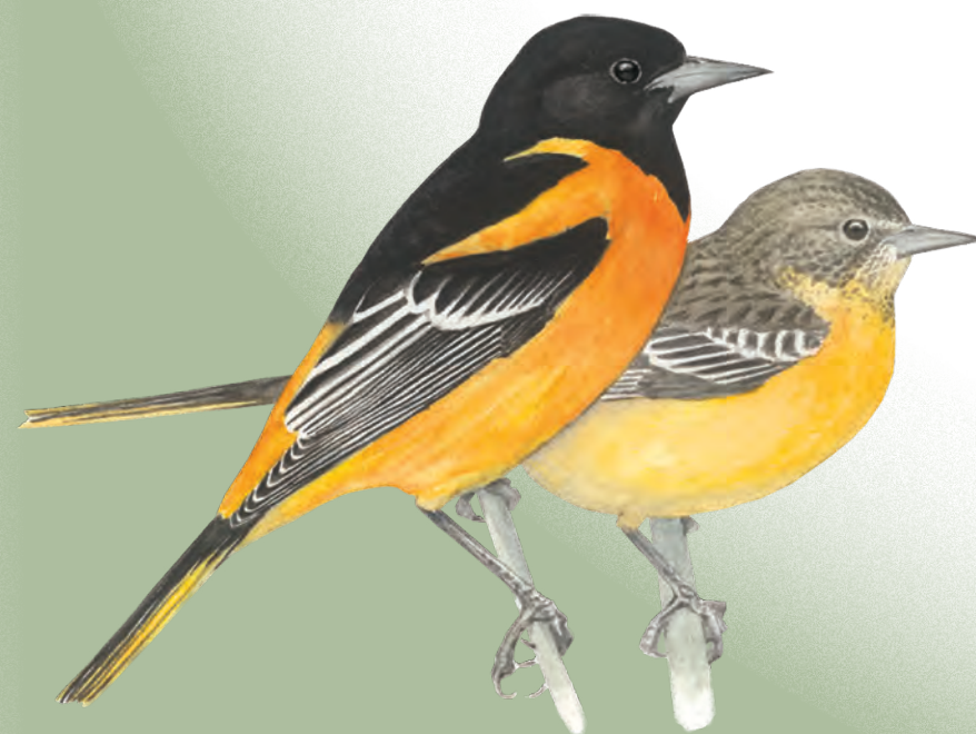
Baltimore Oriole Icterus galbula