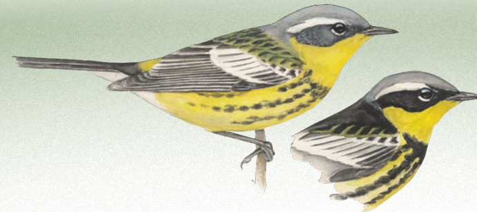
Magnolia Warbler Dendroica magnolia