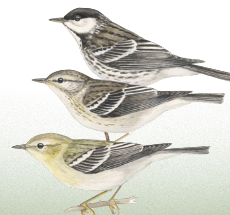
Blackpoll Warbler Dendroica striata