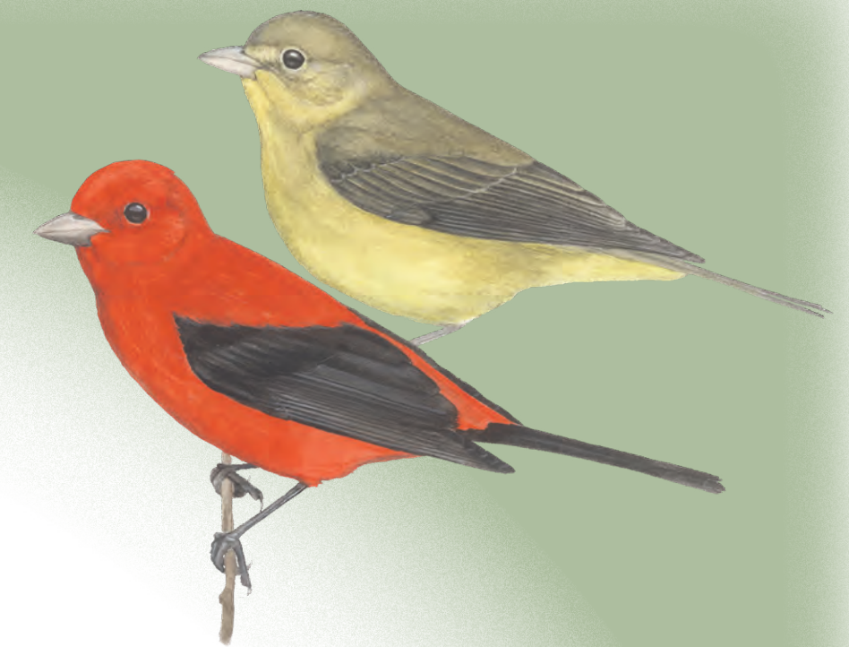
Scarlet Tanager Piranga olivacea