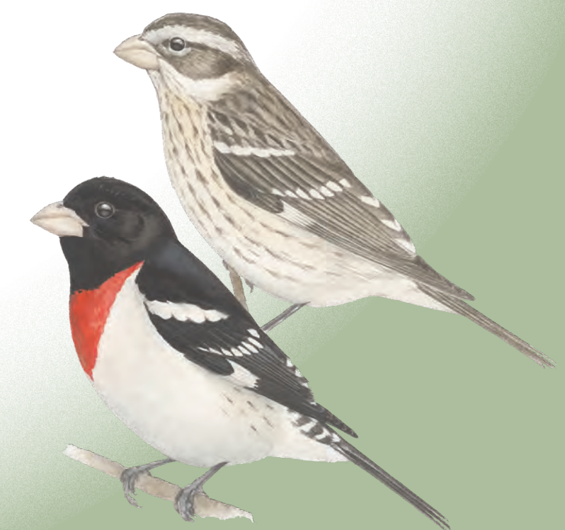
Rose-breasted Grosbeak Pheucticus ludovicianus