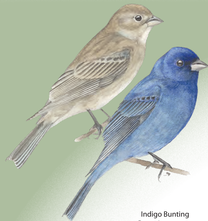
Indigo Bunting Passerina cyanea