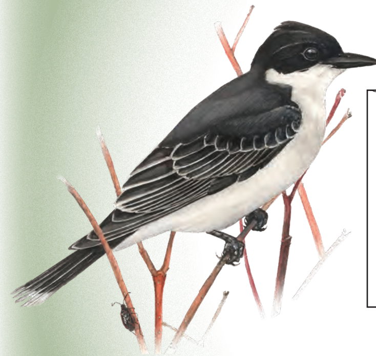
Eastern Kingbird Tyrannus tyrannus

Find out where more than 500 bird species spend the winter: www.AllAboutBirds.org/BirdGuide .