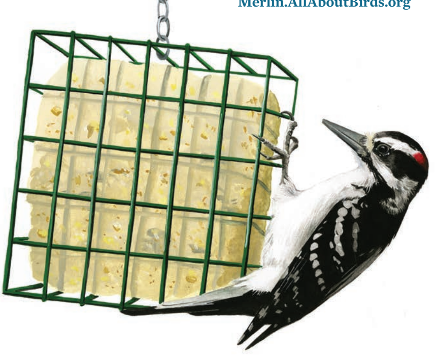
Hairy Woodpecker on suet feeder